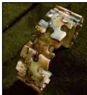
PICTURE DIRECTORY: TOP LEFT - PLASTIC WATER BOTTLE WREATH. BOTTOM LEFT - PLASTIC BAG JELLYFISH. TOP CENTER - QUILLING WALL HANGING FROM MAGAZINE STRIPS. LEFT - PUZZLE BRACELET TOP RIGHT - COLLAGE BRACELET