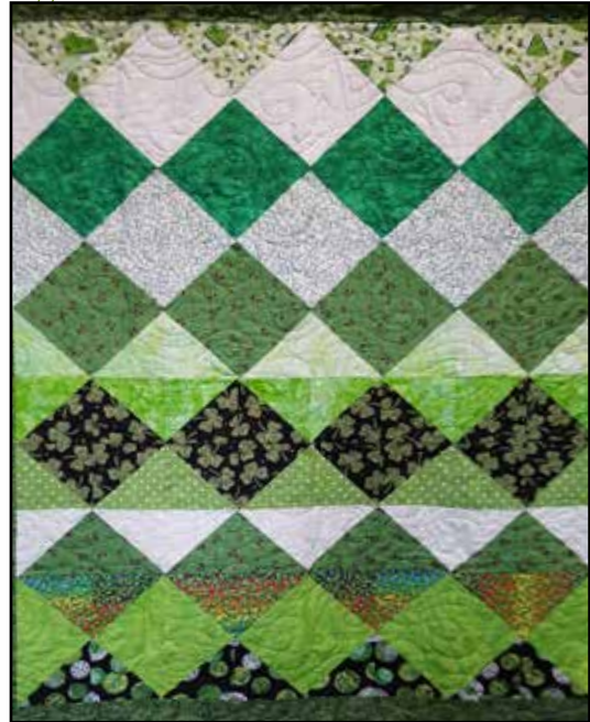
"Eye of the Beholder" by Ellen Owens - 2018 selected for the Honolulu Museum of Art Docent Show