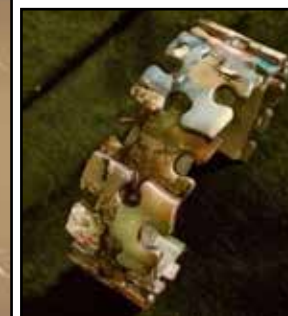
PICTURE DIRECTORY: TOP LEFT - PLASTIC WATER BOTTLE WREATH. BOTTOM LEFT - PLASTIC BAG JELLYFISH. TOP CENTER - QUILLING WALL HANGING FROM MAGAZINE STRIPS. LEFT - PUZZLE BRACELET TOP RIGHT - COLLAGE BRACELET